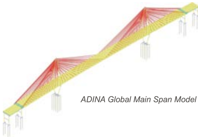
ADINA Global Main Span Model

Local models for towers with distinctive geometric configurations were created. Detailed foundation models of both towers consisting of plasticity based hysteretic soil elements and moment-curvature beam elements representing tower legs, in both the local and global models. Pushover analysis of the towers was conducted to determine their behavior-under seismic loading. These analyses were also used to optimize tower leg sections.